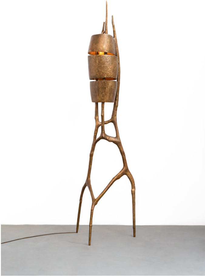
CHARLES TREVELYAN | TRIPARTITE, 2012, BRONZE, LIGHT FITTINGS H227 L60 W52 CM, LIMITED EDITION OF 8 + 4 AP, COURTESY CARPENTERS WORKSHOP GALLERY