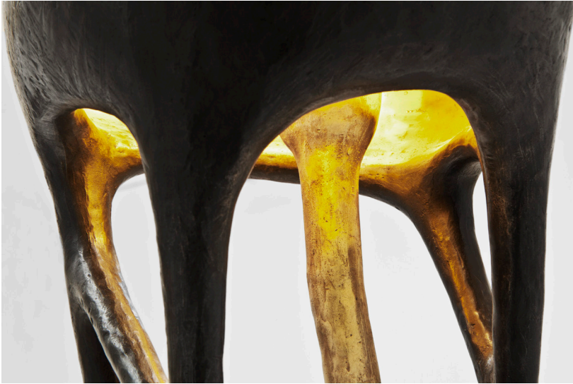
CHARLES TREVELYAN | OUTSIDE WITHIN, 2012, BRONZE, LIGHT FITTINGS H80 L31.6 W30.6 CM, LIMITED EDITION OF 8 + 4 AP, COURTESY CARPENTERS WORKSHOP GALLERY