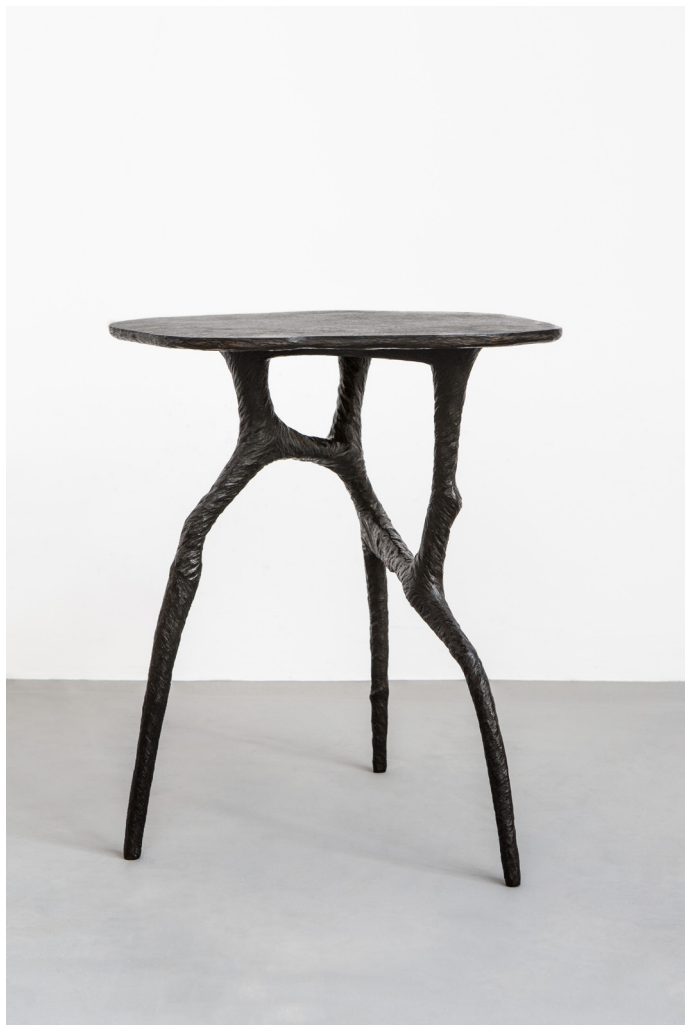
CHARLES TREVELYAN | STANCE (DARK GREY) 2012, PATINATED BRONZE H44 L41 W37.5 CM / H17.3 L16.1 W14.7 IN LIMITED EDITION OF 8 + 4 AP, COURTESY CARPENTERS WORKSHOP GALLERY