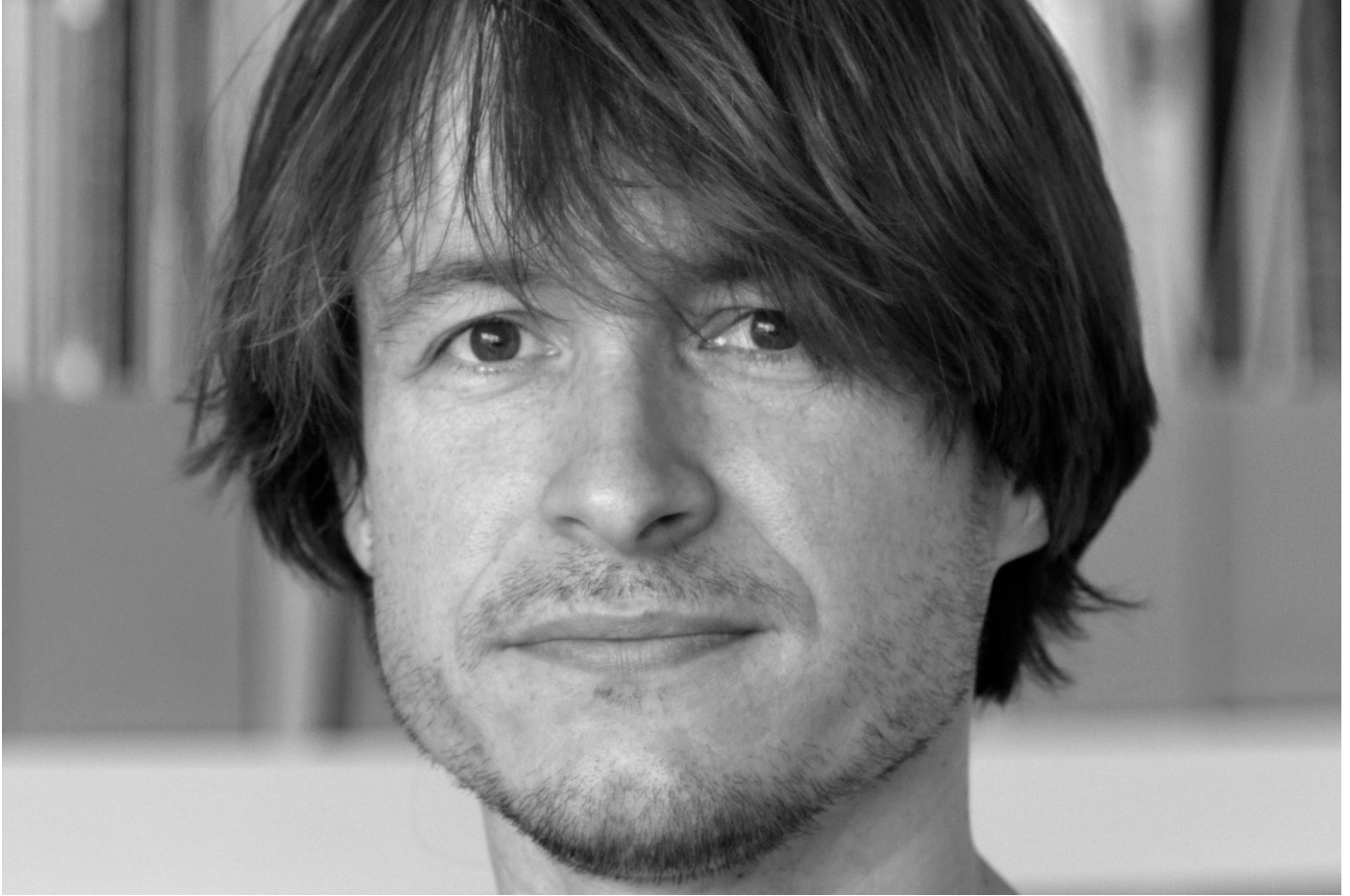
PORTRAIT OF CHARLES TREVELYAN

A UNIQUE EXHIBITION AT CARPENTERS WORKSHOP GALLERY PARIS / 7 SEPTEMBER - 19 OCTOBER 2013 OPENING SATURDAY 7 SEPTEMBER, 4 - 9 PM