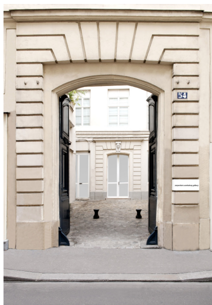
Entrance of the gallery, 54 rue de la Verrerie in the Marais.

Carpenters Workshop Gallery transcends classical borders in terms of art and design. Its proposal stands just at the intersection of these two universes: reaching precisely a symbiosis of art and design.