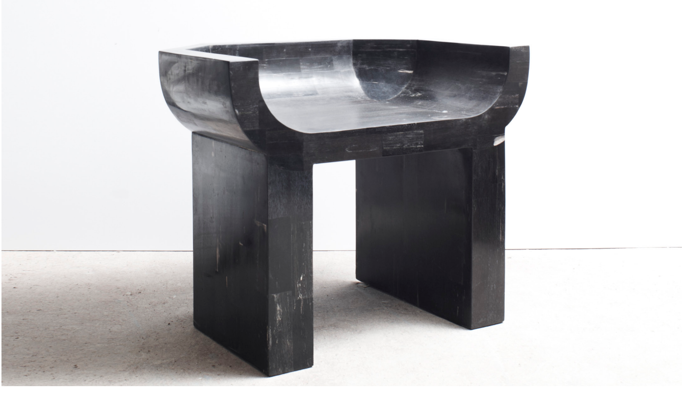
RICK OWENS | CURIAL (PETRIFIED WOOD), 2011, PETRIFIED WOOD, H66 L83 W60 CM / H26 L32.7 W23.6 IN, LIMITED EDITION OF 8 \pm 4 AP

PRIVATE VIEW THURSDAY 12 SEPTEMBER 6 - 8 PM