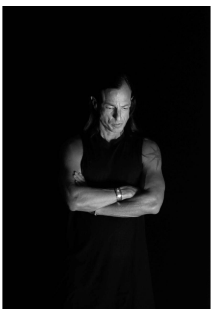
PORTRAIT OF RICK OWENS

From September 9<sup>th</sup> to November 29<sup>th</sup>, Carpenters Workshop Gallery will show in London an exceptional exhibition by the designer Rick Owens. A unique exhibition which presents a series of unusual pieces, especially designed for the gallery space.