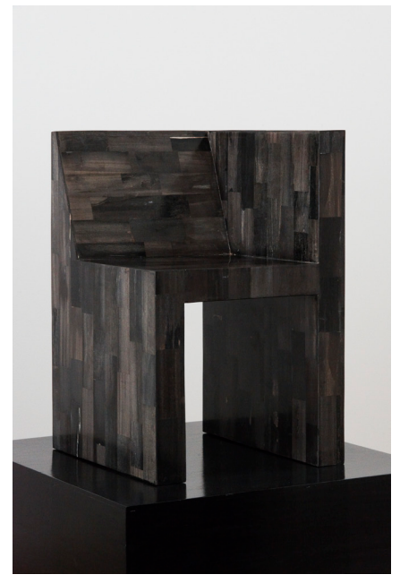
RICK OWENS | HALF BOX (PETRIFIED WOOD), 2011 PETRIFIED WOOD, H77 L50 W50 CM / H30.3 L19.7 W19.7 IN LIMITED EDITION OF 8 + 4 AP

Through his choice of subtle and rare materials, Rick Owens suggests the beauty of original nature and develops a contrasting palette of black and white that confirms the designer's taste for the monochrome. The 500,000 year old fossilized wood throws up subtle nuances of smoked brown and the blackened plywood provides a counterpoint to the lighter tones; alabaster, a sublime material used by sculptors in Sumerian times whose transparent pallor echoes the color of the ivory of a cow's bone. Dealt with in juxtaposition, the values come together and compose a three-dimensional piece that is totally relevant to the designer's own style. He cuts and shapes a transversal and global universe, from fashion to furniture.